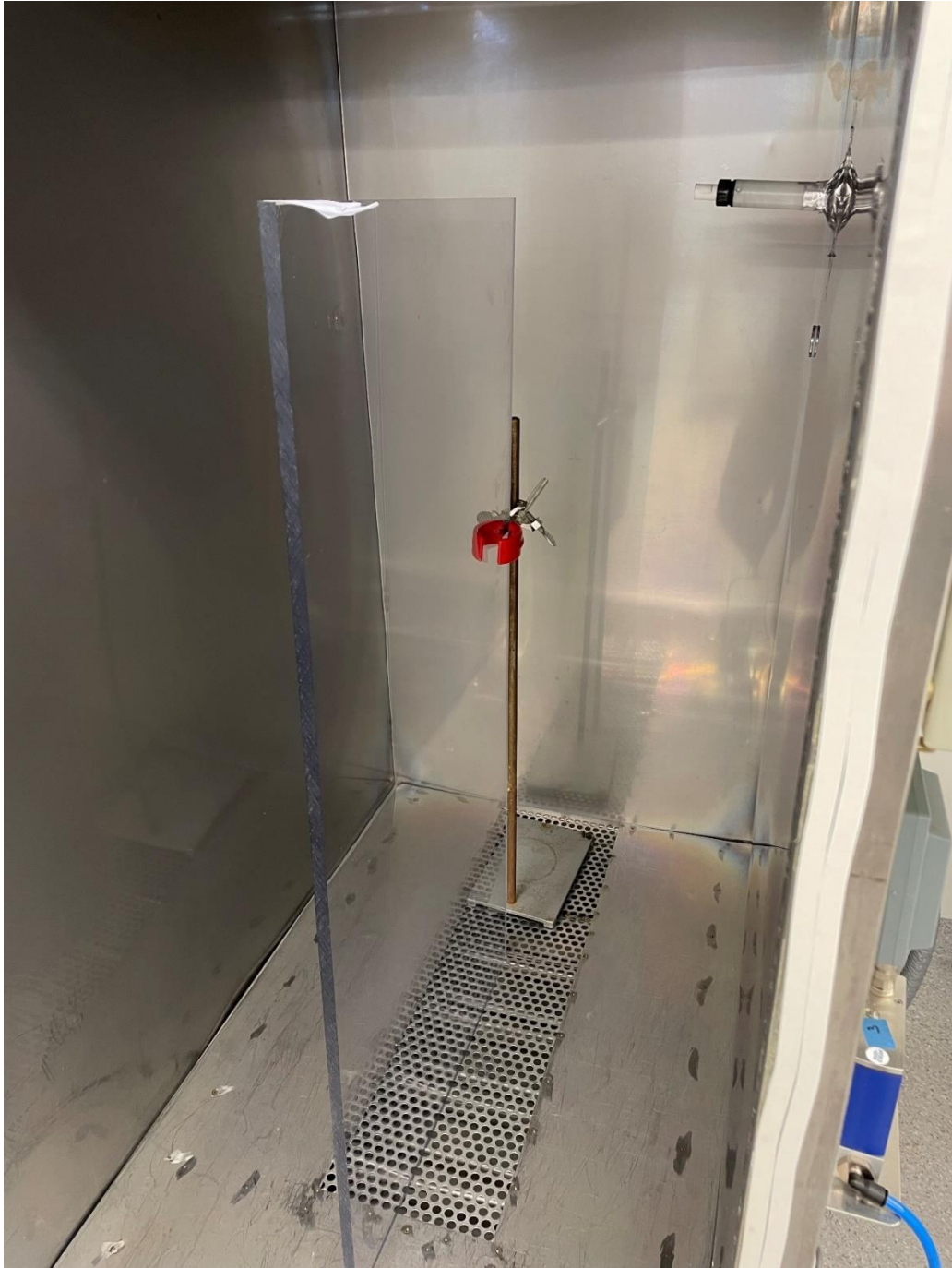
Photo of the test specimen